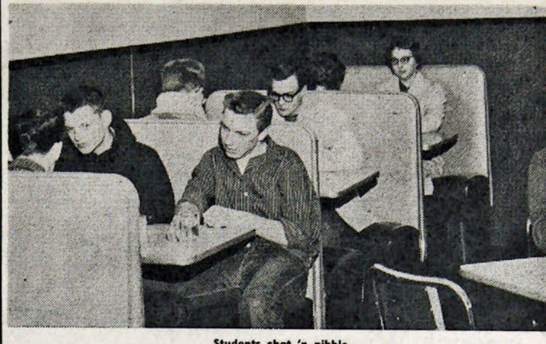
Students chat 'n nibble