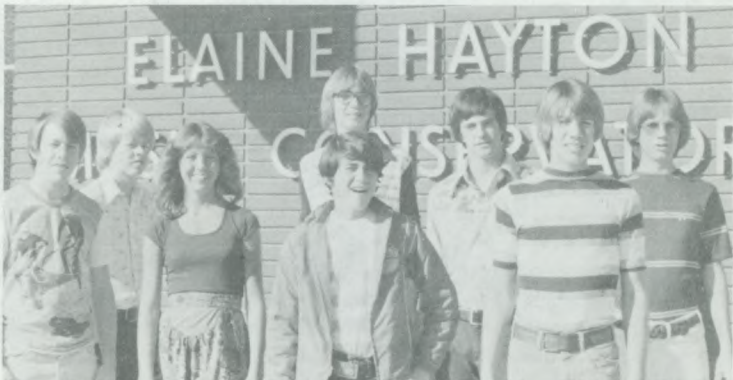
Redlands Junior Academy Band officers gather in front of the Elaine Hayton Music Conservatory.

Monday Dec. 6 7:00 p.m. Anaheim Church 900 S. Sunkist Street Sunday Dec. 12 9:30 a.m. San Diego North Park Church 3090 Polk Avenue Monday Dec. 13 7:00 p.m. Conference Office 9707 Magnolia Avenue