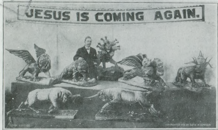
PROPHETIC SYMBOLS, ILLUSTRATING THE PROPHECIES OF DANIEL AND REVELATION USED BY EVANGELIST WM. SIMPSON

Won't you help make Christmas and the coming year a little more special to some needy individual? Please send your Bibles to: Faith for Today , Box 1000, Thousand Oaks, CA 91360.