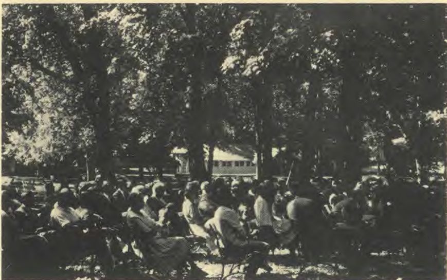
Audience at camporee church service

For the "Bible Speaks" rally we were glad to have E. C. Haas present to the youth from the Academy