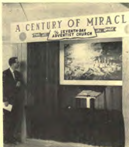
Illumidrama at Iowa State Fair

A large amount of literature was given away, including the book, A Century of Miracles , given away each day. Fair-goers were invited