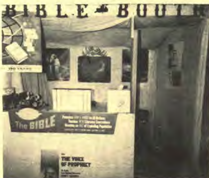
Beach Fair Booth

One of the men that registered for a free Bible said that he hoped to