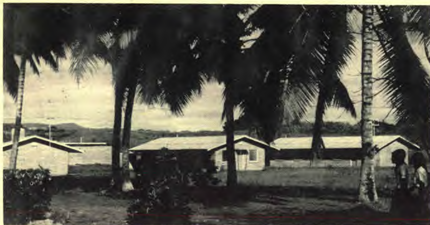
Three new dormitories for the girls of Betikama Central School, Solomon Islands. Thirteenth Sabbath Overflow Project, Fourth Quarter 1965.