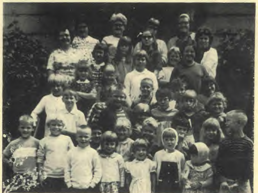
Hinckley Vacation Bible School

These children represented towns from as far away as Mora and Ker-