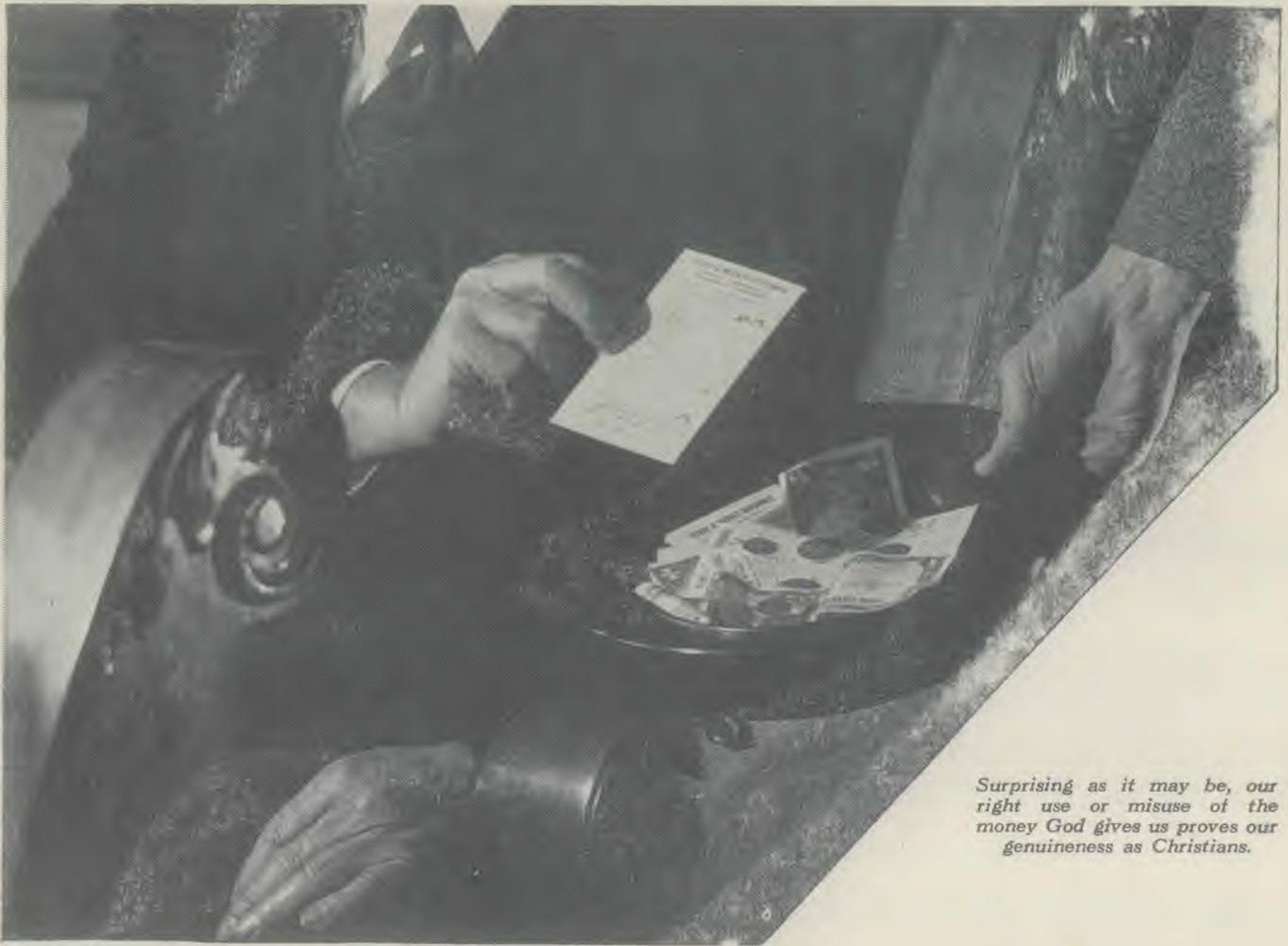
Surprising as it may be, our right use or misuse of the money God gives us proves our genuineness as Christians.