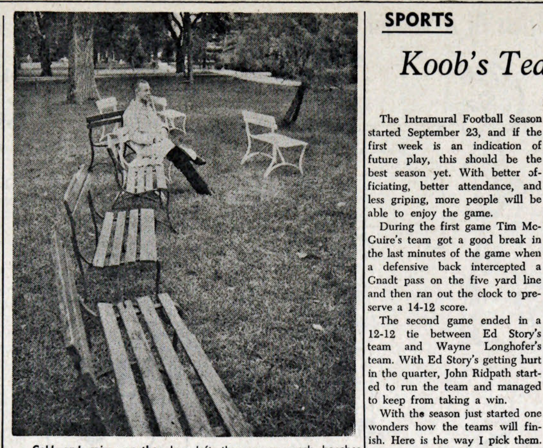
Cold and rainy weather has left the campus park benches deserted for the most part, but the CT photographer caught raincoatclad Jim Gardiner in a last soliloquy to fall.