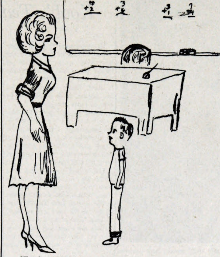
"Teacher, What do you want to be when you grow up?"