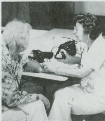
This lady attended the first risk evaluation series, then returned to check her progress in lowering cholesterol levels.

At both clinics, persons have been found with serious problems, who have been directed to their personal physicians and encouraged to take the series of risk factor-reducing classes.