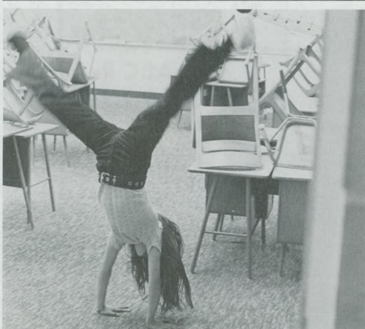
Remember when there was no greater glee than when school was out—until about two weeks into vacation?

Make your plans now to attend this Open House on September 11. Hours will be 10 a.m.-4 p.m. The address is 320 N. 44th Street, Phoenix.