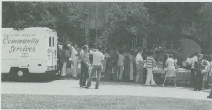
Santa Ana Spanish Pathfinders give a mass-feeding demonstration to National Red Cross leaders during their convention at Claremont College.