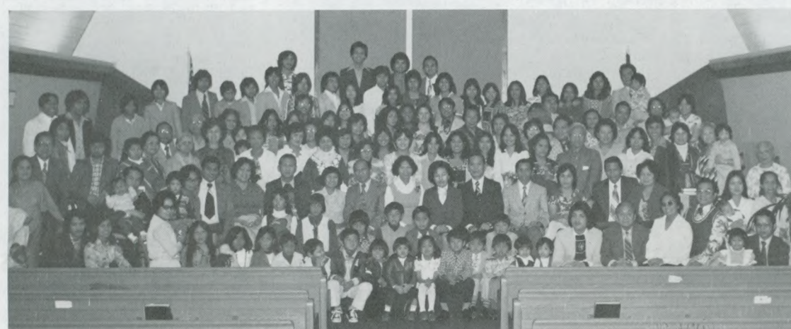
The San Francisco Filipino congregation has more than doubled in membership since its organization 10 years ago.