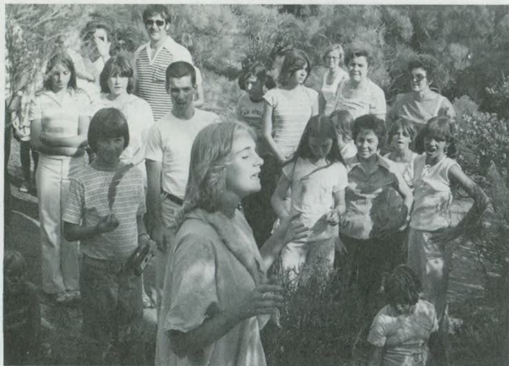
"WALK THROUGH THE BIBLE" is a weekly Sabbath event at Pine Springs Ranch. Here Job's wife voices her complaints.