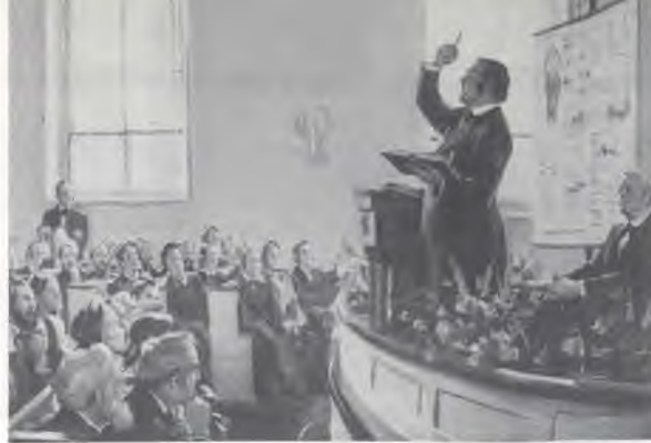
Baptist layman, William Miller, prominent among the 19th Century preachers who emphasized the nearness of the second coming of Christ. Below: Modern Adventist church in Naerum, Denmark, is one of many thousands which today belt the globe. Lower: Porter Sanitarium in Colorado, is representative of a vast medical missionary work operated by Adventists throughout the world.

Scarcely had the Church begun to organize itself when America was rent in twain by the Civil War which began in 1861. The Adventists were not split into northern and southern factions for the simple reason that there were no southern Adventists, but the war diverted the minds of men for a time from religious interests; and when conscription was introduced other problems were posed especially for ministers. The American government, however, recognized the Church's objection to bearing arms and granted its members noncombatant status. In this it showed itself a good deal more liberal than the British authorities some fifty years later, when Adventist and other conscientious objectors were