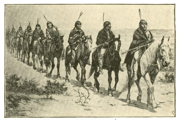
AN INDIAN FILE

The amount appropriated by the government to be devoted to the interests of the Indians through 1906 was $8,000,000. Of this amount, $3,777,000 was for education. The Indians of