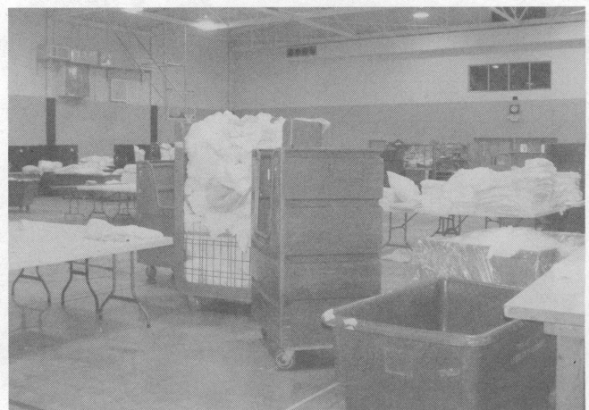
Gym where clean laundry is assembled for delivery