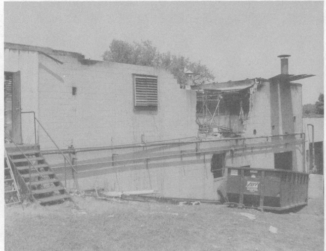
East outside wall in area where fire started