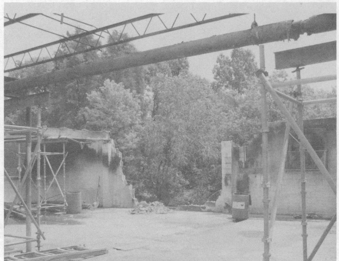
Same wall from inside