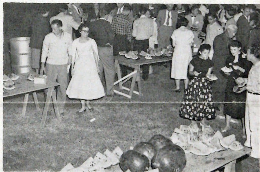
As a climax of the evening's program, students and staff enjoy themselves with the last of the season's watermelon.