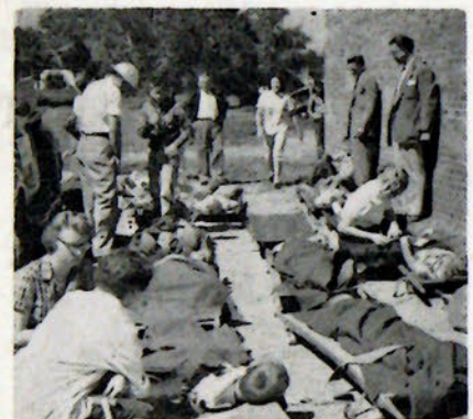
As part of their training, these students in the Union College school of nursing in Denver, take part in the annual Civil Defense Disaster Day held at Porter Sanitarium.

Tuesday, August 21 at 9 a.m. a plane flew over a forty-acre tract south of the campus at Porter Sanitarium, 2525 South Downing St. and dropped a bomb on 135 victims, who were strategically placed with predetermined blast effects such as shock, fractures and burns. With this action the third annual Civil Defense demonstration open to the public was underway.