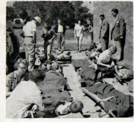
As part of their training, these students in the Union College school of nursing in Denver, take part in the annual Civil Defense Disaster Day held at Porter Sanitarium.

Tuesday, August 21 at 9 a.m. a plane flew over a forty-acre tract south of the campus at Porter Sanitarium, 2525 South Downing St. and dropped a bomb on 135 victims, who were strategically placed with predetermined blast effects such as shock, fractures and burns. With this action the third annual Civil Defense demonstration open to the public was underway.