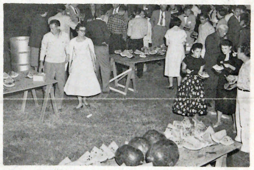
As a climax of the evening's program, students and staff enjoy themselve with the last of the season's watermelon.

The evening ended with a watermelon feed.