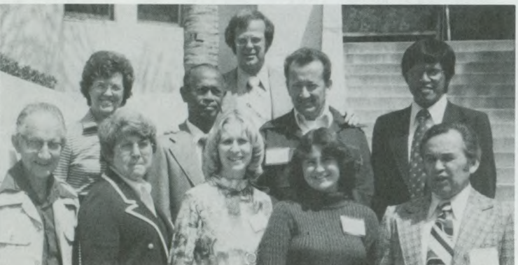
Ten were in attendance at the pilot SETAC session.

The pilot program for the Southeastern Training Action Center (SETAC) took place April 3-8. Meetings were held in the Helen Rice Residence,