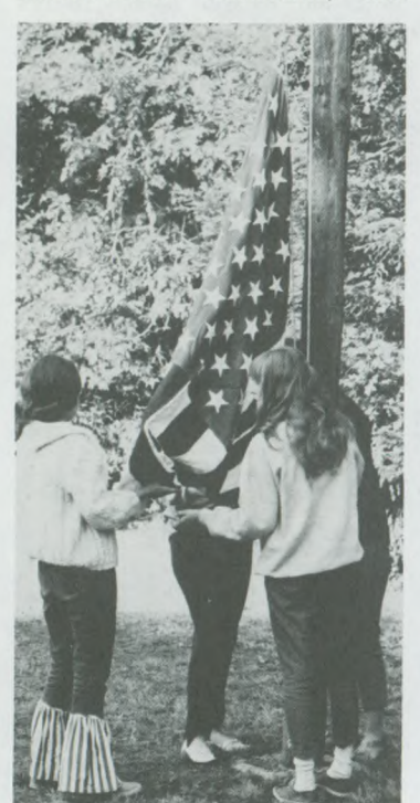
Days at Summer Camp begin remembering God honoring country.

Aimed at determining whether classes of nutrients or specific foods have an effect on growth and development, the research will be conducted mainly at Seventh-day Advent-ist elementary schools and junacademies in Southern and Southeastern California, and