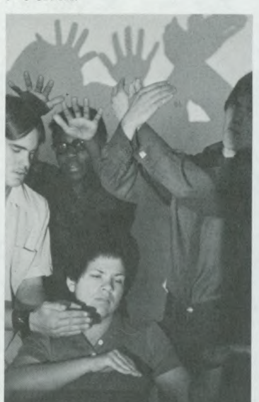
Sign language pictures a boat,

"Hands for Christ," a nonprofit, missionary-oriented or-ganization served largely by the deaf, will present its first play "The Beauty of the Silent World" at La Sierra Academy, 4900 Golden Avenue, Riverside, on Sunday evening, May 22, at 7 o'clock