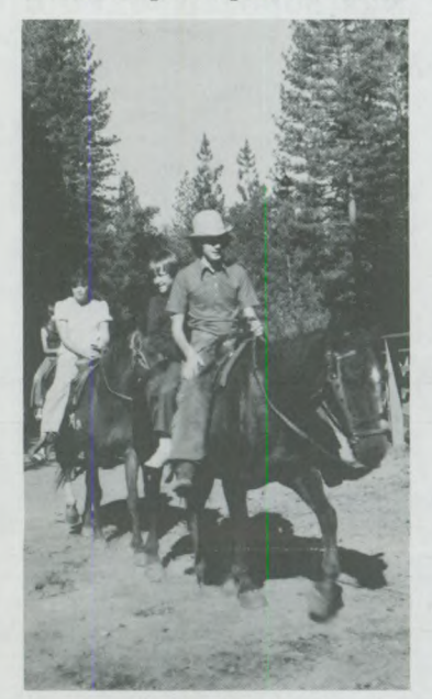
Camping brings hours on nature

Her eager personality was soon felt throughout the camp. To be asked—to be needed and appreciated—was exhilarating. She was the first to volunteer when her counselor needed tasks performed. At Indian Camp one night she even volunteered to participate in Indian