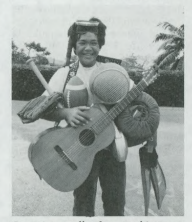
Camping calls for packing-at least planning so you don't forget something.

included Trust My Knot, Compass Relay, and Drill Master's Delight.