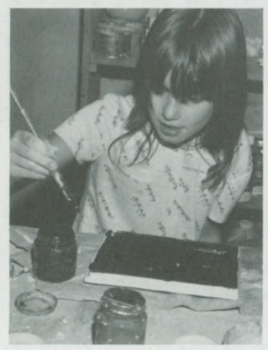
Summer Camp offers adventures

The correct phone number is (213) 375-2904.