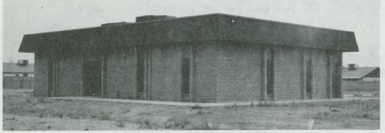
Maryvale church stands as a tribute to the dedication and determination of members who labored four years for the sanctuary.

In October of 1976, they met for the first time in the new building and Elder Ralph Lar-