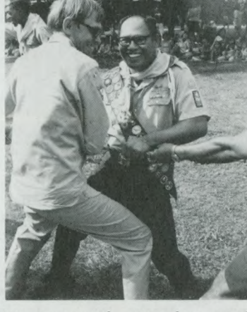
Directors and counselors tried to pull Pathfinders over the line in a tug-of-war, but the Pathfinders proved too much for