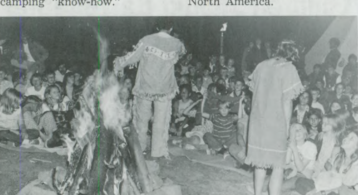
Camping includes Indian Village campfire tales.

Wawona sports something else "super"—the only Adventist camp with specialized ministry to multi-handicapped individuals. Christian Record Braille Foundation's Nu-Vision Camp is headquartered at Wawona-nationally unique, drawing campers from throughout North America.