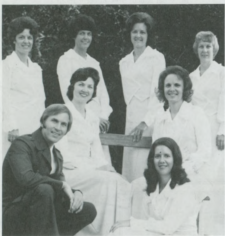
The Miriam Singers will be heard in sacred concert God's Love

"Words of appreciation are always acceptable gifts."