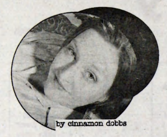
Today's question: "What do you love?"