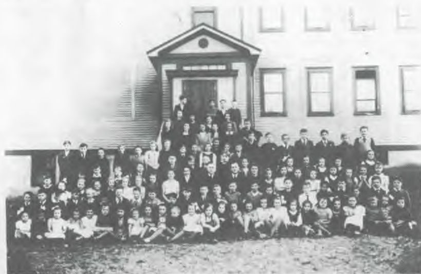
The staff and students of St. John's Academy in the early 1940s.