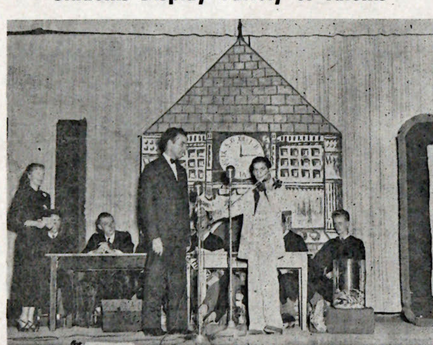
A scene from the student talent program held in Union College gymnasium