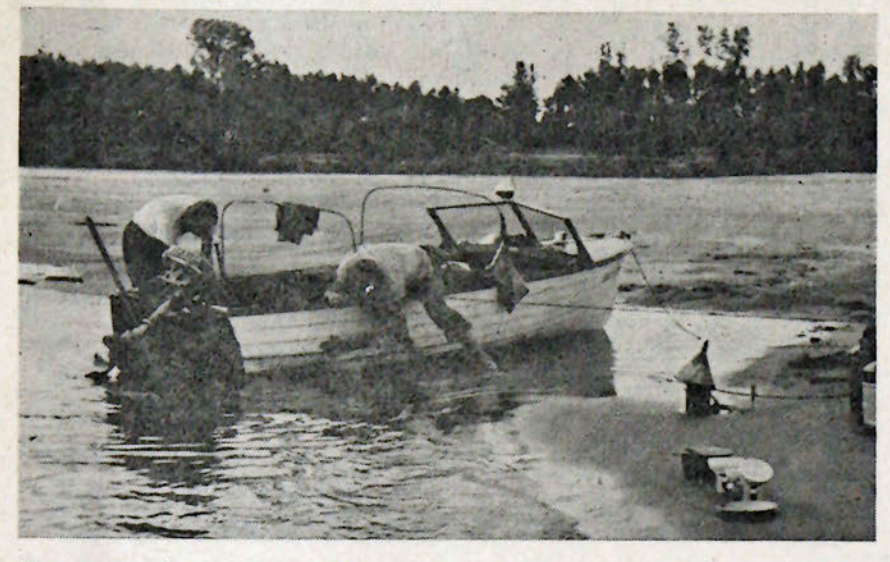
Clean-up time for the Vagabond II during trip of four Unionites down the Mississippi.