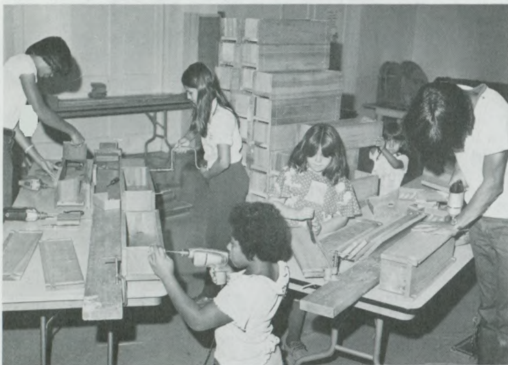
Academy students drill holes and drive screws as they make window box planters as Christmas presents for the 256 homes in Waterman Gardens. They were later filled with soil and seed.

Tables were set up in front of McDonalds, a department store in downtown Brawley.