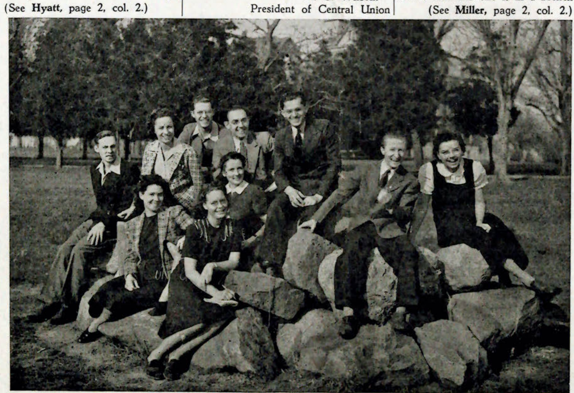
The Rock Pile, A Popular Gathering-place.

The chapel periods were especially helpful. Visitors and teachers brought helpful messages, inspirational talks, mu-(See Summer Term, page 2, col. 2.)