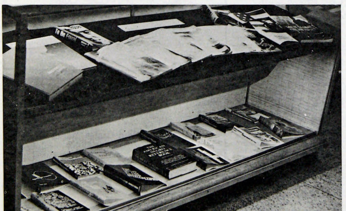
BLACK HISTORY WEEK-A library display featuring recently acquired books concerning black history highlighted black history week at Union College. In connection with the week's activities, the Afro-American Club will present the program in convocation this morning.