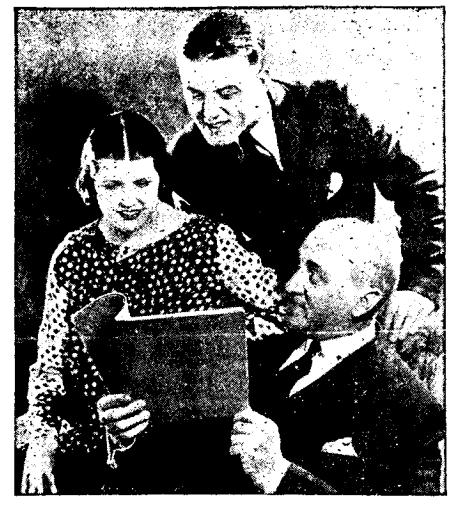
The colporteur work trains for leadership. There is no better way to prepare for the future.

Every young man and woman can receive an education if they are willing to work for it. The way is open for scores of young men and women to begin early this spring to earn their scholarships for the school year of 1935 and 1936. The scholarship plan has been so adapted that you can receive the regular 20 per cent bonus on a scholarship as low as $100.