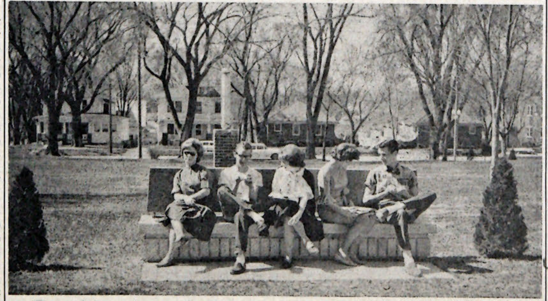
The conclusions to be drawn from this campus scene: (1) these students are not seniors,

If U.S. tourists in Jordan see a man wearing a bright-colored bowling shirt advertising "Eat at Joe's" he is not a refugee from a bowling alley in America. The man probably will be an Arabicance wearing a used bowling shirt-one of some 1,000 coffeeted by a Lutheran bowler and sports writer in Washington, D.C., and shipped abroad by Lutheran World Relief.